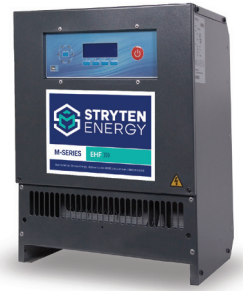
EHF >>> EHF