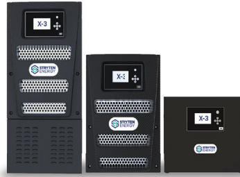
Fury X-3 >>> X-3