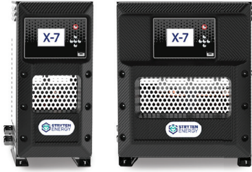
Fury X-7 >>> X-7