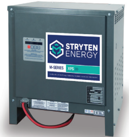
EF XPS >>> XPS