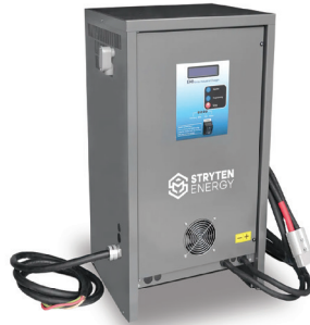
EHI >>> EHI