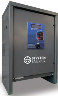
EHY >>> EHY