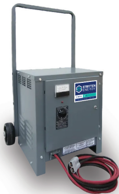
CC Constant Charger >>> CC