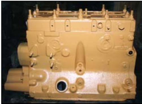
Full Flow Engine (Open Port)