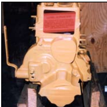
No Radiator Mount