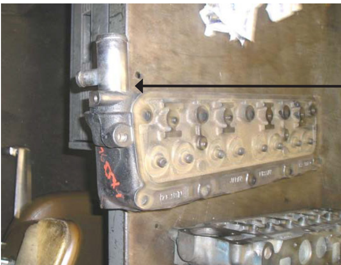
No bolt remote thermostat cylinder head