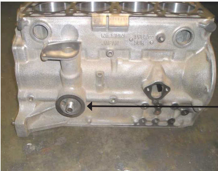
Oil filter screws into block "K" serial number block