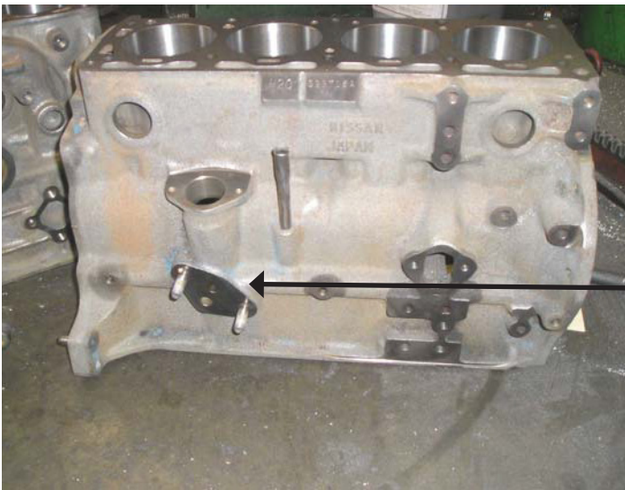
Oil filter screws into adaptor "S" serial number block