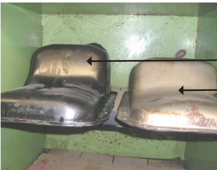
Deep oil pan